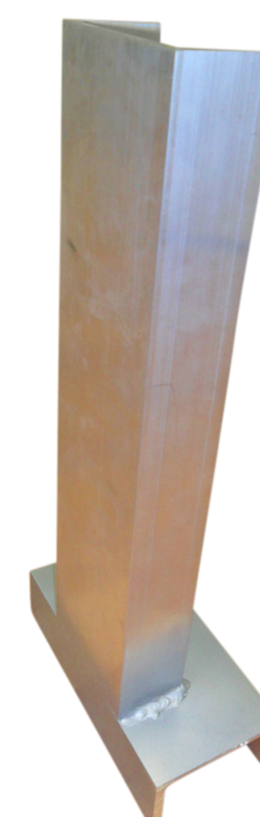
Figure 5. Electrical box support