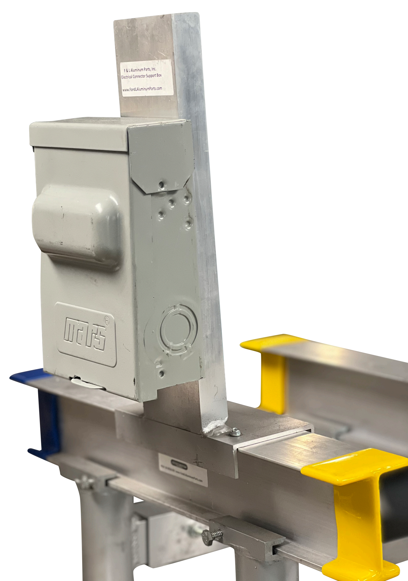
Figure 4. Electrical box support example