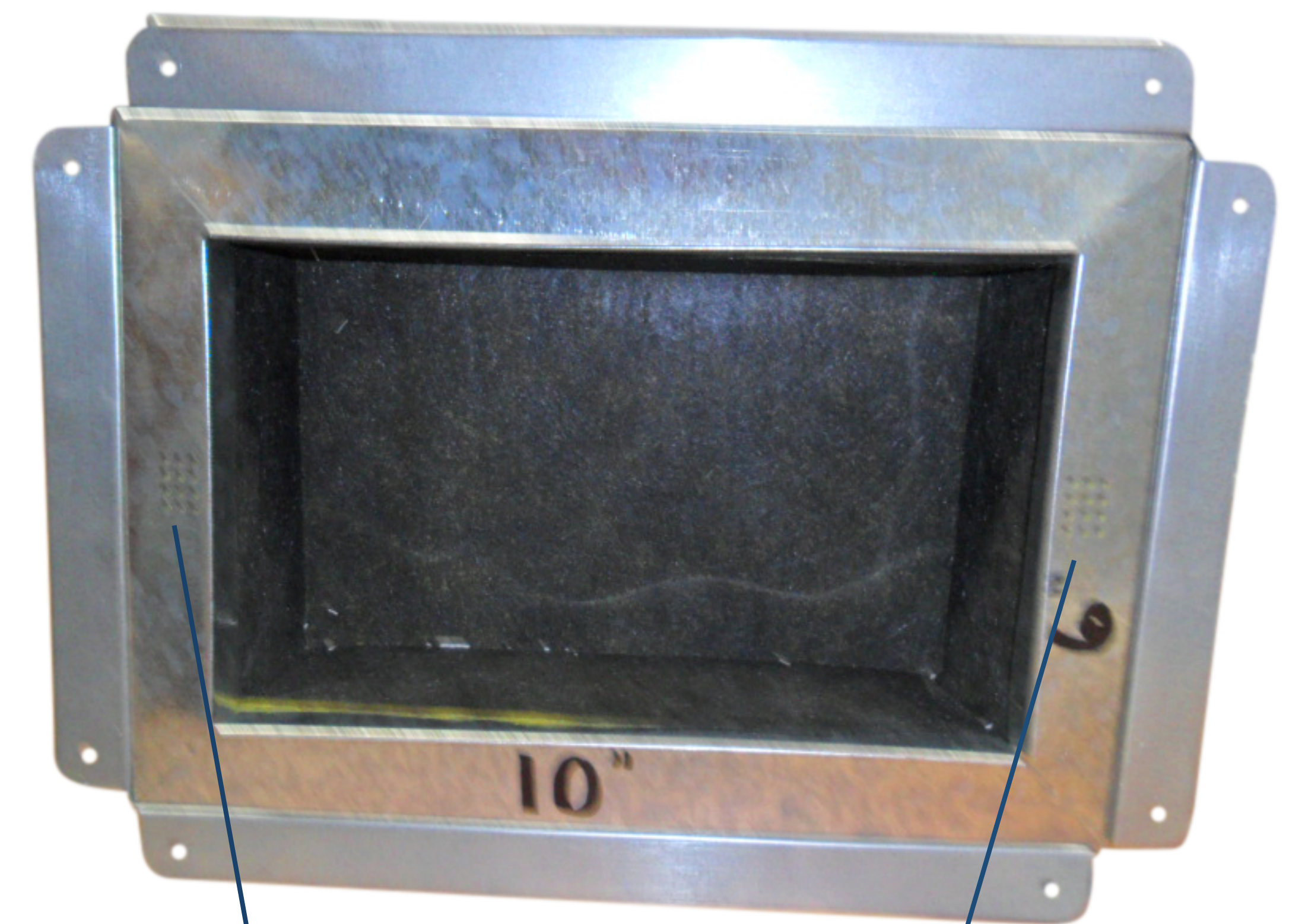
FLR6B(Length x Width)