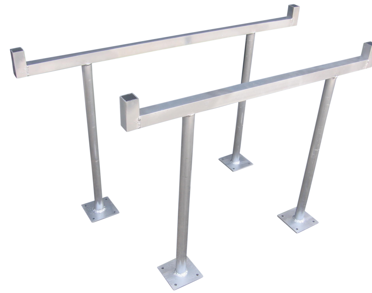
FLPS(Height x Width)

Double leg pipe stands for widths over 24" wide Fixed option or adjustable height option